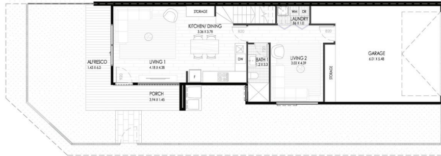
GROUND FLOOR- UNIT 6

NOTE: This project is provided solely for informational purposes and does not constitute an offer or contract. While every effort has been made to ensure the accuracy of the information provided, it is subject to change without notice. Prospective buyers should conduct their own due diligence and seek independent professional advice before making any decision. The marketing team and its affiliates do not accept liability for any loss or damage arising from reliance on the information contained herein. All images, illustrations, and perspectives are indicative only and may differ from the final construction.