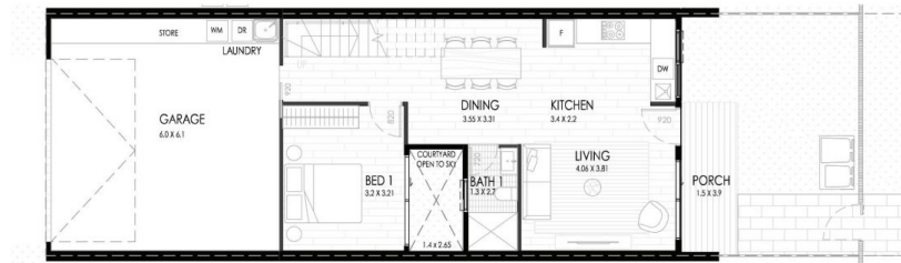
GROUND FLOOR - UNIT 8 & 10

NOTE: The marketing plan is intended solely for informational purposes and does not constitute an offer or contract. While every effort has been made to ensure the accuracy of the information provided, it is subject to change without notice. Prospective buyers should conduct their own due diligence and seek independent professional advice before making any decisions. The marketing plan and its contents do not constitute an offer or a contract. The drawings, illustrations, or perspectives are indicative only and may differ from the final development.