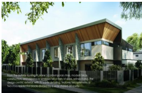
From the outside looking in, Hane's contemporary lines, modern brick construction, and expansive windows tell a story of sleek, refined living. The design-centric exterior, with its subtle detailing, features two symmetrical two-story residential blocks divided by a wide shared driveway.